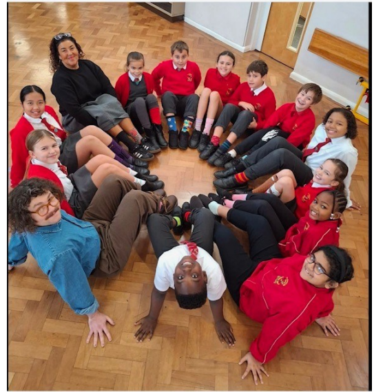
Anti-bullying and Respect Week, led by our Anti-bullying Ambassadors